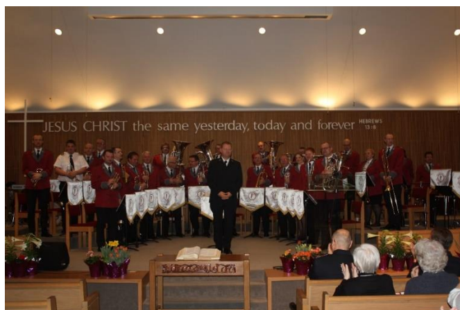
Field Trip to watch the Norway Salvation Army Band Performance in Rockford, IL