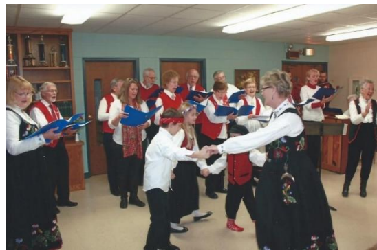
Fox Valley Norwegian Choir