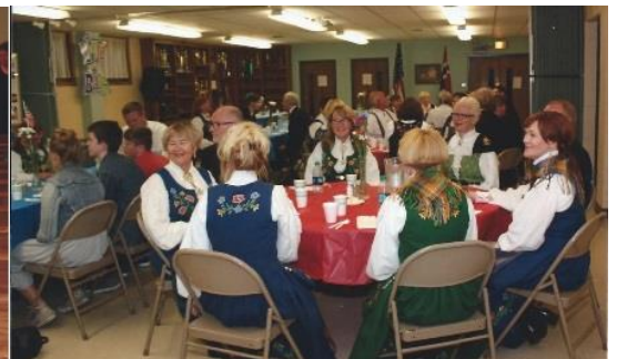
Polar Star hosting the Bødo, Norway Choir