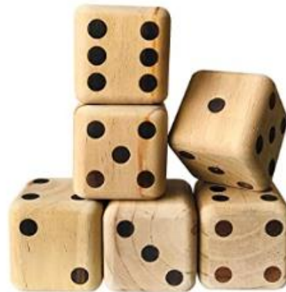
YH poker Giant Wooden Playing Yard Dice