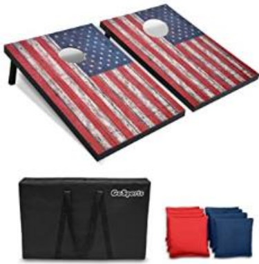
GoSports Classic Cornhole Set - Includes 8 Bean Bags, Travel Case and Game Rules (Choose between American Flag, Football, Rustic,