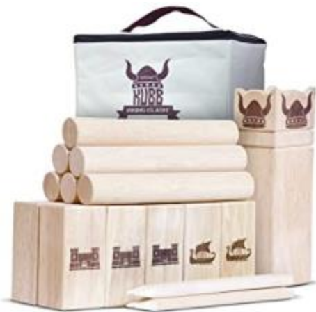
GoSports Regulation Kubb Viking Clash Toss Game Set for Kids & Adults