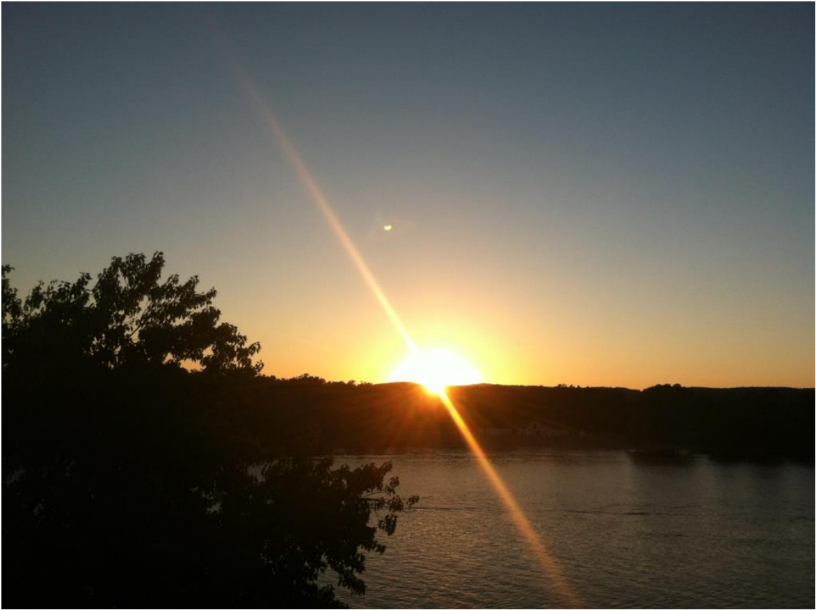
LaCrosse International Frienship Gardens