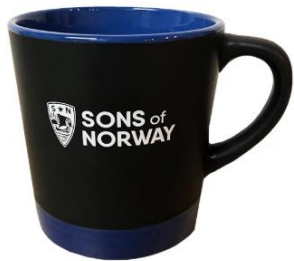
SOFN - 12 Oz. Two-ToneAmericano Mug Two-toneAmericano mug! It holds up to 12 oz. of coffee and comes in a stylish combination of black with a blue color accent. It meets FDA SOFN-7168 $6.00 and up Favorite