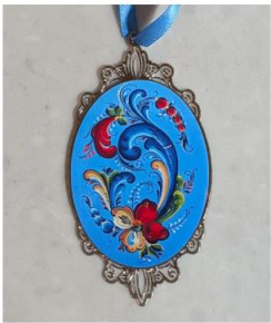
SOFN Limited Edition 2025 Rosemaled Ornament Show your Norwegian pride this holiday season by adding the 2025 Sons of Norway commemorative ornament to your Christmas traditions. With SOFN2025ORN $25.00 and up Favorite