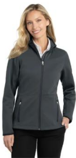
SOFN - Port Authority® Women's Pique Fleece Jac... An intriguing pique texture and a cozy fleece interior make this jacket a perfect choice around the office or paired with jeans on the weekend. $7- SOFN1222 $55.00 and up Favorite