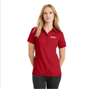
OGIO - Jewel Polo. OGIO - Jewel Polo. Imperfectly designed for women everywhere, the Jewel has a contoured fit and streamlined style. 8-ounce, 100% poly pique with SOFN-LOGIO1 $47.00 and up Favorite

https://sofn.logoshop.com/ProductResults/?ProdSetIds=109764