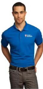
OGIO - Caliber2.0 Polo OGIO - Caliber2.0 Polo Accelerate beyond the limits in this high-performance polo that pays tribute to your favorite jeans with its SOFN-OGIO1 $47.00 and up Favorite