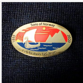
SOFN Anniversary Lapel Pin (ON SALE!!!) Show your Nordic pride wherever you go with our 125th Anniversary pin! This gold-plated, enameled pin features our commemorative emblem