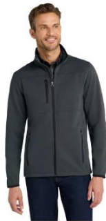
SOFN - Port Authority® Pique Fleece Jacket An intriguing pique texture and a cozy fleece interior make this jacket a perfect choice around the office or paired with jeans on the weekend. $7- SOFNF222 $55.00 and up Favorite