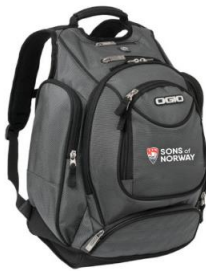
SOFN - OGIO - Metro Pack. OGIO - Metro Pack. Stocked with options, this impressive bag organizes gadgetry and belongings for quick access. 420D dobby poly/600D poly 600D SOFN-222