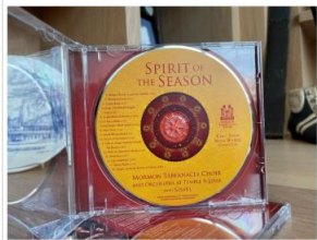
Spirit of the Season CD - Christmas with Sissel K... Spirit of the Season: Christmas with Sissel Kyrkjebø and The Mormon Tabernacle Choir Fill your home with over 60 minutes of delightful SOFN-7168