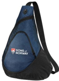
SOFN - Honeycomb Sling Pack. Port Authority - Honeycomb Sling Pack. Honeycomb texture adds interest to this budget-minded sling pack that includes an audio pocket with SOFN-222