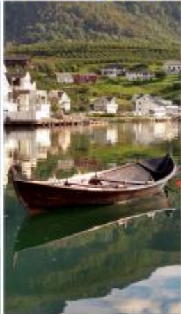
Allen Watrud Vennelag 5-513