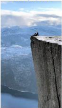
Mathea Diedrich Idun 5-074