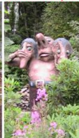
Michael Charman Shawnee Skogen 5-689

In the above photo, Connie Kross' photo "Sami couple" is shown. This was votegetter #11, just outside of the Peoples' Choice top 10, but I rather show you a great picture than just some white space. The top troll is shown in spot #12.