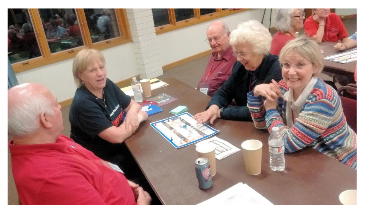
Attendees from 2017, playing the "Who Me" game and sharing their Scandinavian experiences.

The conference cost is $320 per person, which includes a two-night stay (double occupancy, with a bathroom per room), five meals and snacks. Single occupancy is $480. If you stay off campus, cost is $180. The "off campus" is set by Cedar Lake Ministries, and includes all five meals and use of their facilities. They don't have a "per meal" program.