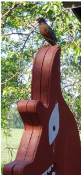
Is this bird a robin or a Norwegian eagle atop the dragon? American Robin, Turdus migratorius -male