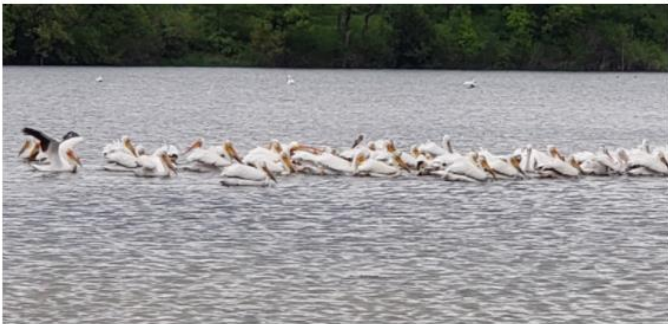
American White Pelicans, Pelecanus onocrotalus on a lake in Madison, WI