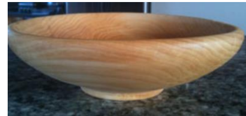
Viking Age Bowl