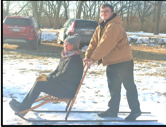
Push me on the Spark!