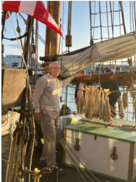
President Ken on board the Restauration 200 in Stavanger, Norway 7/3/25