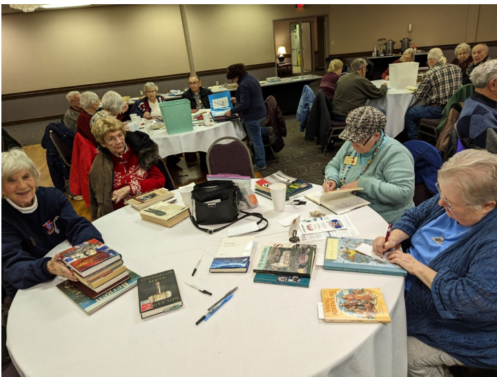
Each table was given a box of Library books to peruse.