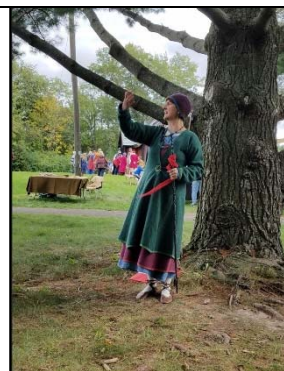
Stories of Viking age women