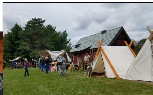
Viking reenactors, artisans and crafts at Viking Fest at UW-Green Bay Sept 23-24