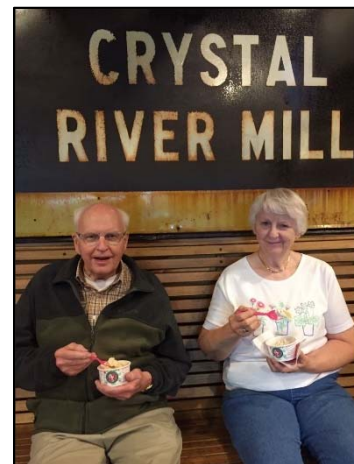
August 18 Lodge Road Trip to Scandinavia, Nelsonville, & Waupaca