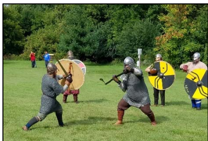
Warrior & armament demonstration