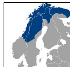
Homeland of the Sámi people at present - Wikipedia

Dokumentet ble til som et tillegg til grensetraktaten som ble forhandlet fram mellom Danmark-Norge og Sverige i 1751.