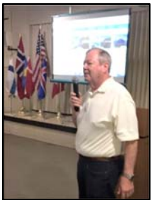
Norway travel by Butch Pomeroy