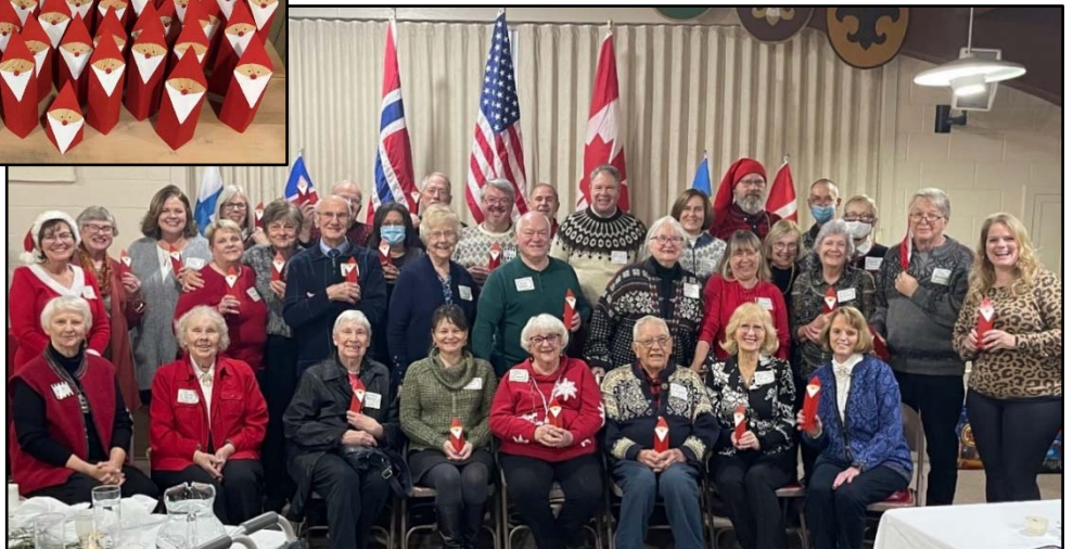
43 Attendees at Julefest 2021 plus over 80 nisse! These folks look happy.