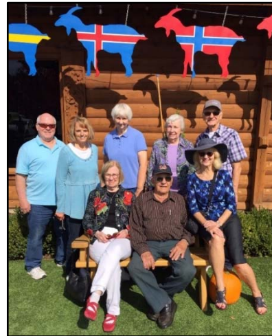
A September Lodge trip to Door County