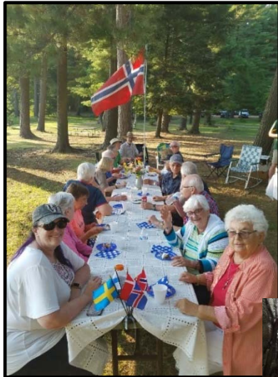
July pie social at Collins Park