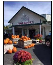
Fall in Door County