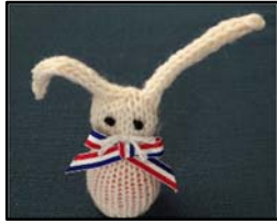
Lodge officers share knit bunnies at Easter