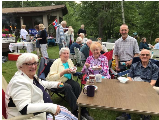
Smiles all around!