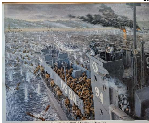
LCI-94 at D-Day 1944, Print on display at DCMM; original 9'X12' mural at Coast Guard Academy, New London, CT,