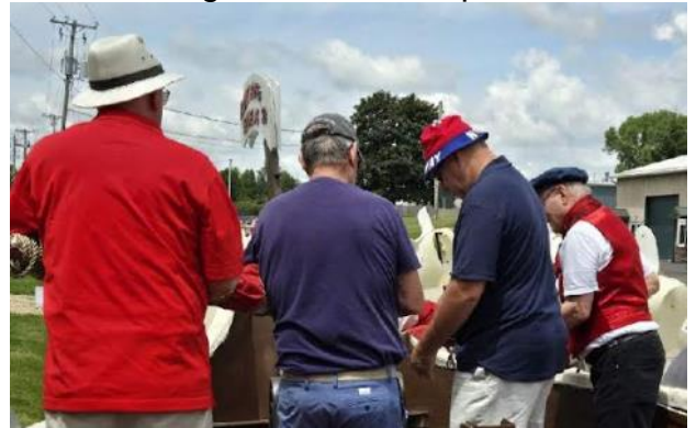
Lefse Makers for Kaffe Stue: