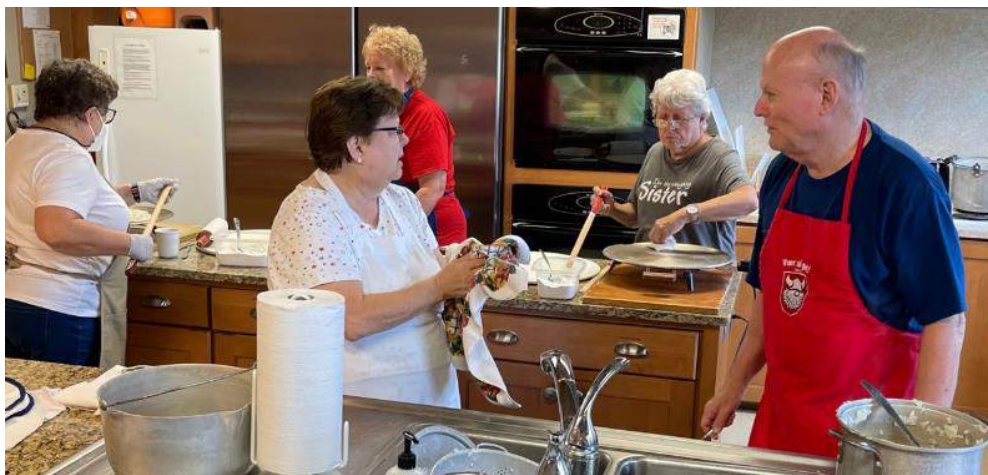
Discussions about how to eat the lefse.