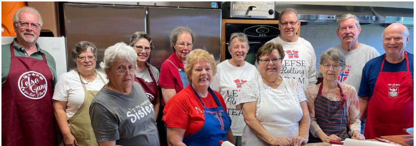
The Lefse Rolling crew!