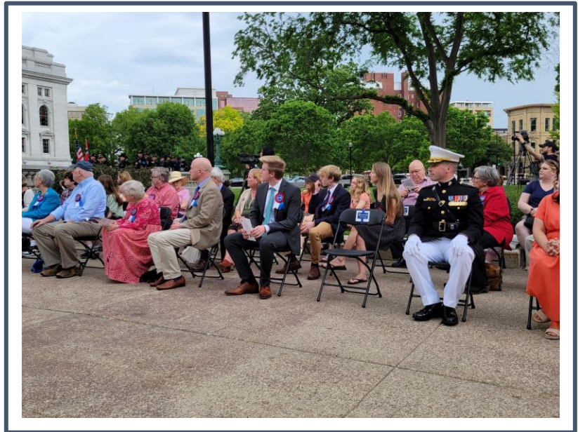
Twenty-five Heg family descendants attended from across the U.S.