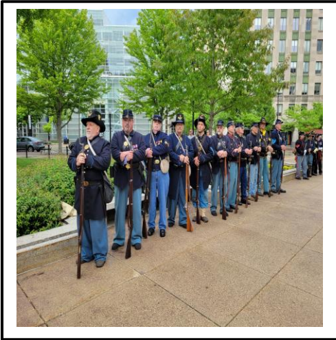
Ready for a 21-gun salute