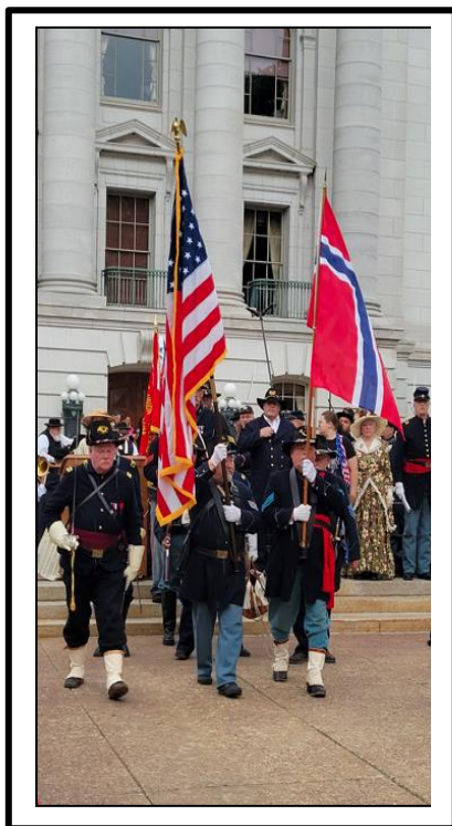
Presenting the colors