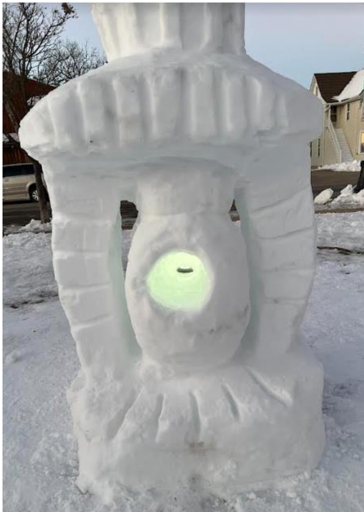
Second snow-sculpture from the Scandihoovian festival in February.

Make sure you are keeping track of your hours that you work on Kaffe Stue for the end of the year Non-Profit reporting –Thank you!!