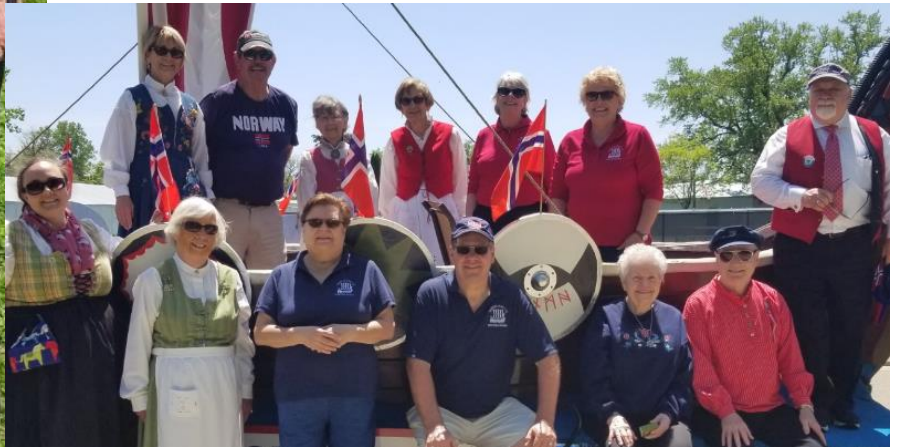
Stoughton Syttende Mai sailing crew above.