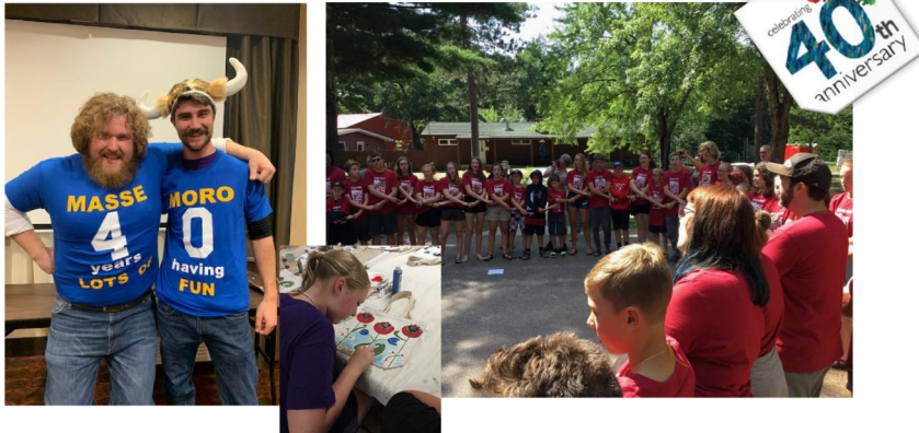
We welcome you to Masse Moro (Lots of Fun)!

My role as the Youth Director is to do my best to make this year's SON Norwegian Heritage Camp, Masse Moro, a success for our campers, staff and volunteers.