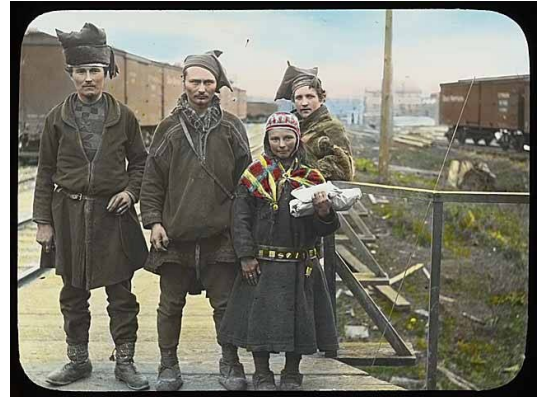
Property of Museum of History & Industry, Seattle