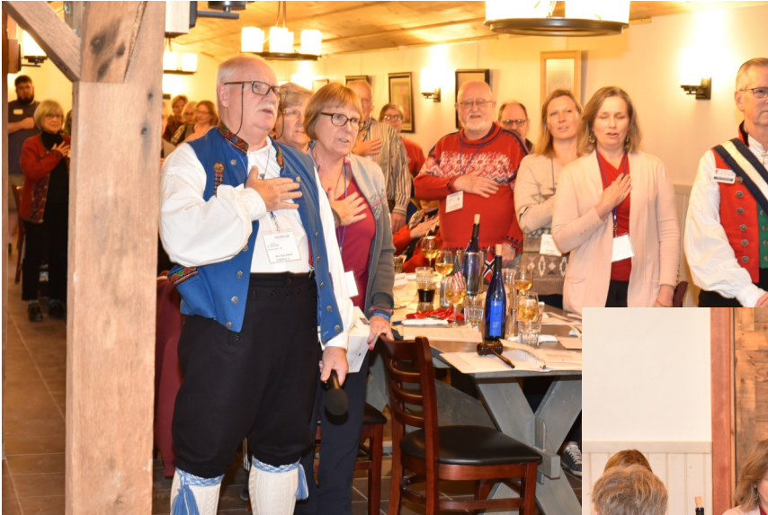
Pledge of Allegiance The meeting begins...