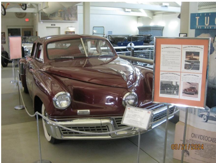
The Tucker automobile. One of 47 in existence.