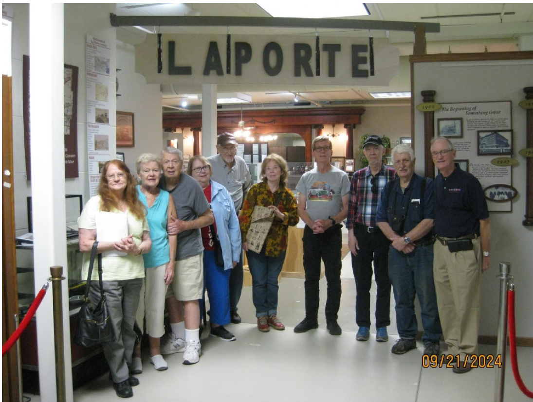
Our handsome group at the Museum.