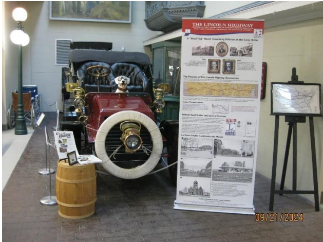
The Lincoln Highway was the first paved transcontinental road in the US. It ran through northern Indiana.