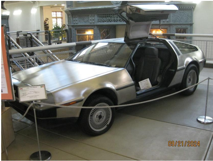
The DeLorean automobile. Featured in the movie "Back to the Future."