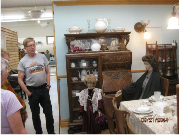
A later period room