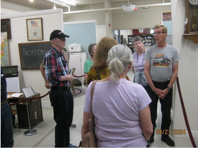
Some of our group. See the schoolroom and early refrigerator in the background