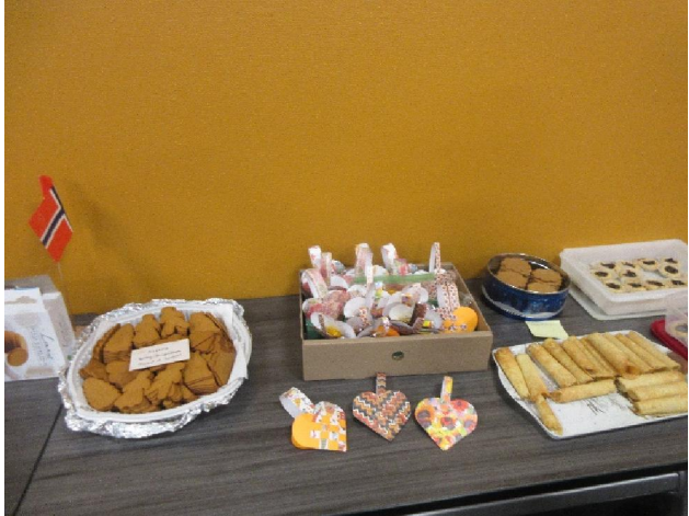
Our delicious array of Christmas cookies