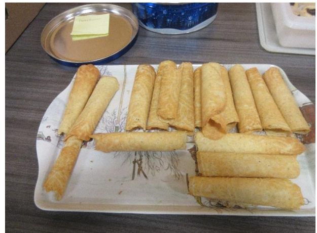
Krum kager – a crowd favorite