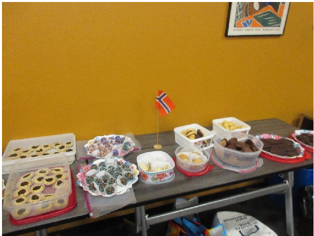
More Christmas cookies