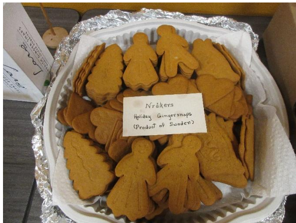
Gingersnaps imported from Sweden.