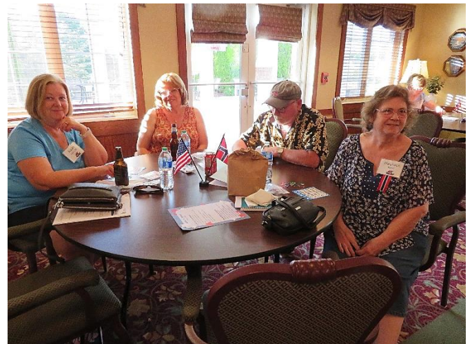
PLAYING BINGO AFTER OUR MEAL