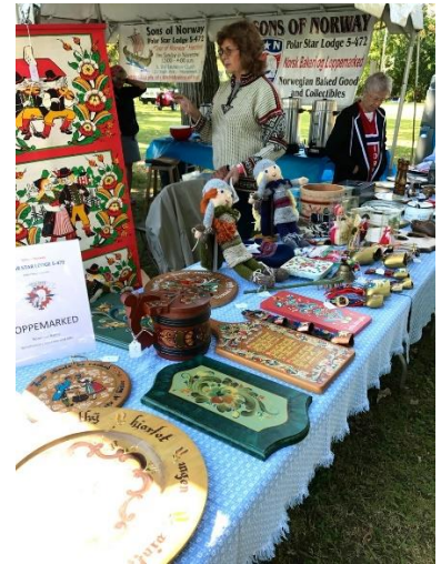
Coming Soon....to Vasa Park