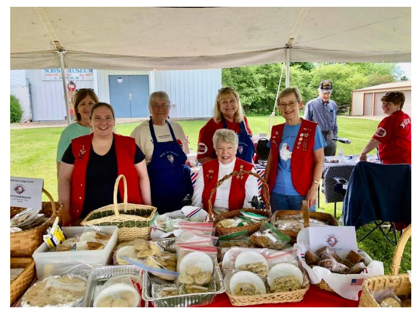
Thanks to our Polar Star Bakers for a successful Norsk Museum Bake Sale