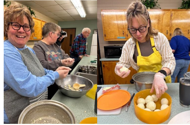
Mix the dough