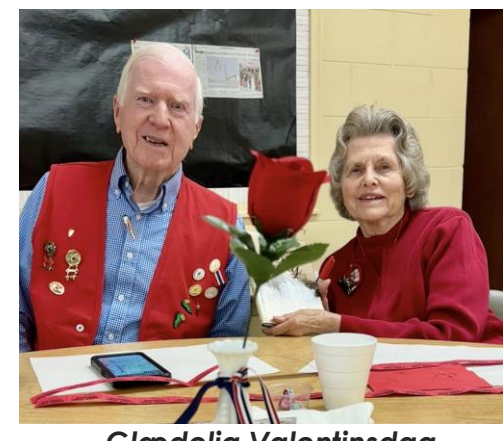
Glædelig Valentinsdag Polar Star