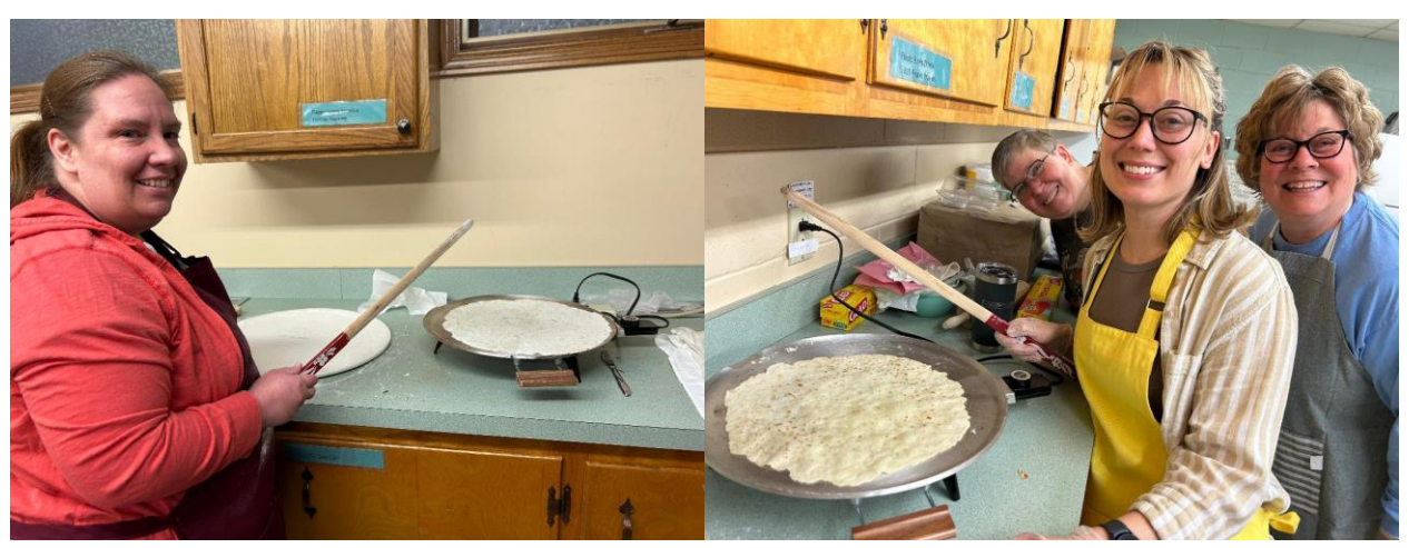
Fry the dough