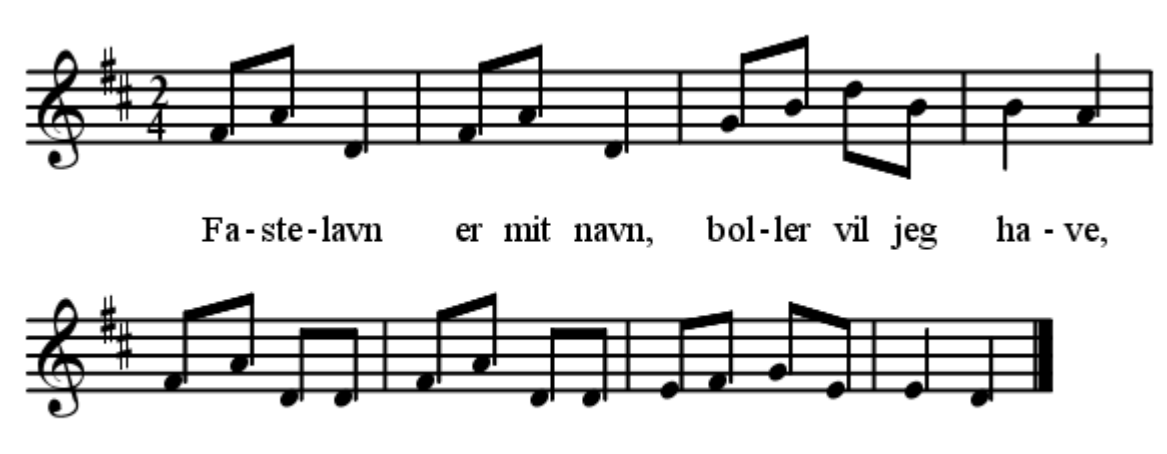
hvis jeg in-gen bol-ler får, så la-ver jeg bal - la - de.

These delicious whipped cream and almond past filled yeast rolls are a very popular seasonal treat in Norway in the days leading up to lent. Many young people will go door to door dressed in costume singing the fastenboller song in hopes of receiving this delicious treat.