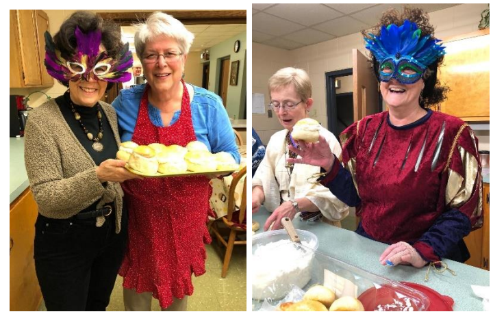
Polar Star fastelavnboller baking at Carnival 2019