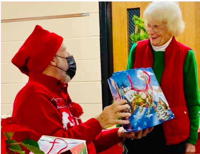
Our Polar Star Julenisse 2021