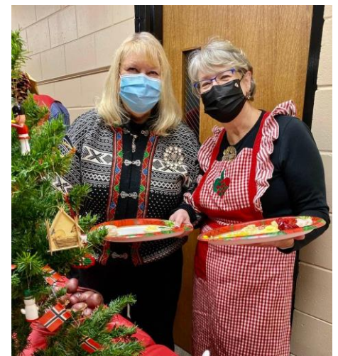
The Benson Girls will present Norwegian American Women at the Jan. 2, 2022 Polar Star Event.

See the sons of Norway Zoom Book Club information on pages 7-8