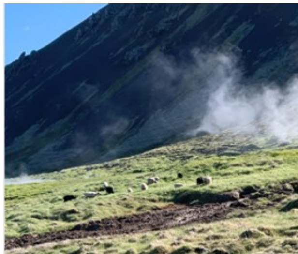
Steam from the geothermal activity.

The route is beautiful - with rushing waterfalls, steaming hot springs and a great view of the mountains, which have extraordinary colors, but it should be said: the way there is steep at the beginning. So you have to earn your relaxing swim in the river. The path ends at the bathing area with wooden footbridges and changing facilities.