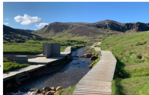
The most beautiful outdoor swimming pool you can find.

What you tend to ignore at first, however: After the relaxing bath, of course, you also have to walk back - probably with wet hair. That's why it's always good to have a hat with you - no matter what the .