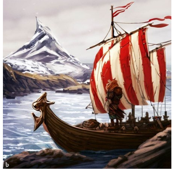
Viking arriving in Greenland.

So, he went back to Iceland. Not one to hold a grudge, Erik met his rival Thorgest in battle while he was there. He was defeated, but survived, and reached a truce with Thorgest. Then, in a stroke of marketing trickery worthy of modern-day corporations, Erik decided to name the land he discovered "Greenland," – even though most of it was covered by an ice sheet – believing that an appealing name would attract more settlers. Erik the Red then led 25 ships carrying friends and their families to settle in the new land. Only 14 of these ships arrived safely, while the others were either wrecked or forced to return to Iceland. This first Norse settlement in Greenland can be dated to between 984 and 986.