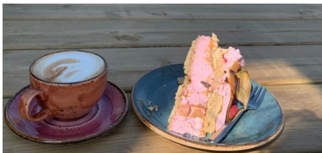
Coffee and cake at Reykjadalur Cafe

What many visitors overlook is the really beautiful little waterfall Reykjafoss, which is located on the way to the parking lot that serves as the starting point for the popular hike to the hot river. In the parking lot, you will also find a nice café with a panoramic view and delicious cake. Here, you can decide whether to stay for coffee before or after.