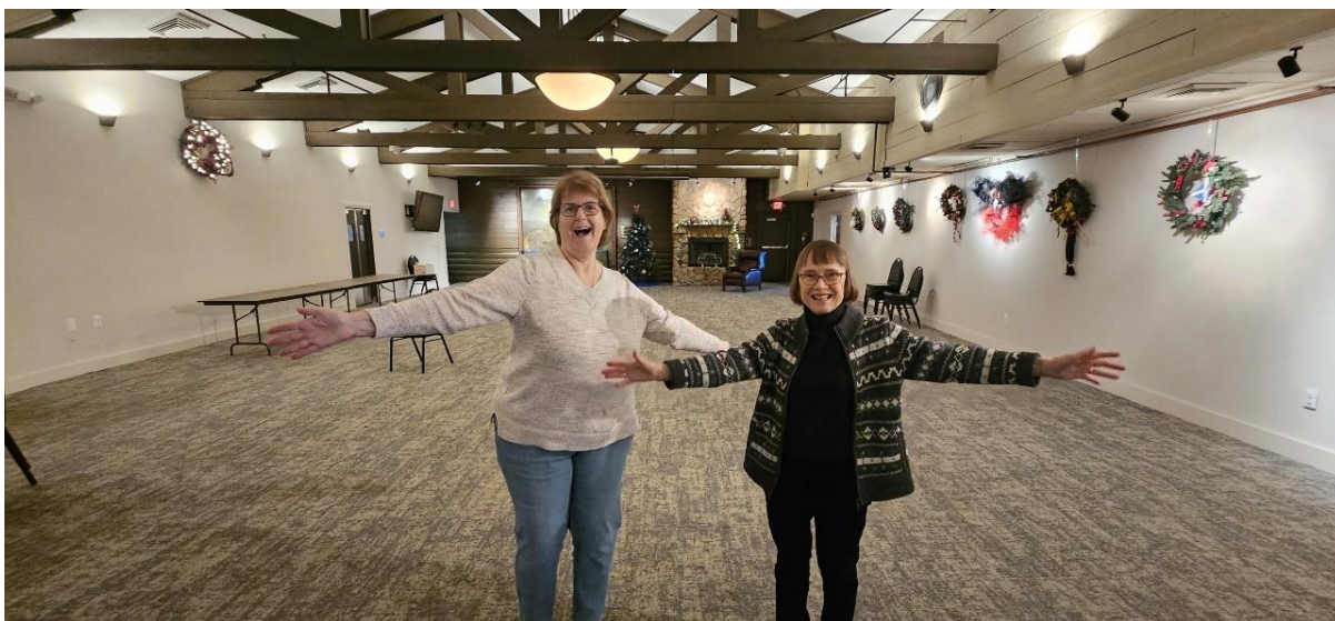
The place is clear. Note the tree at the far back of the room. (Continued next page)