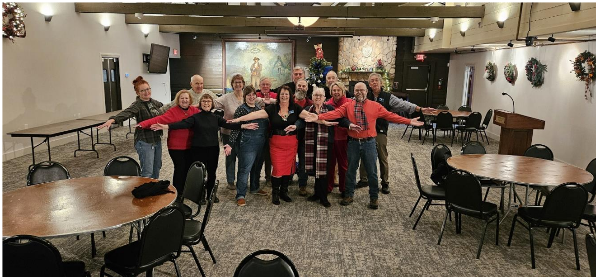
Continued from previous page: The team brings in the tables, chairs, and podium.