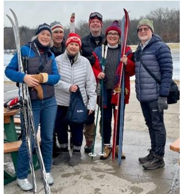
Last year's ski outing

For skiers and non-skiers alike , the metropark has a Ski Center offering a heated lounge, restrooms, and a concession stand.