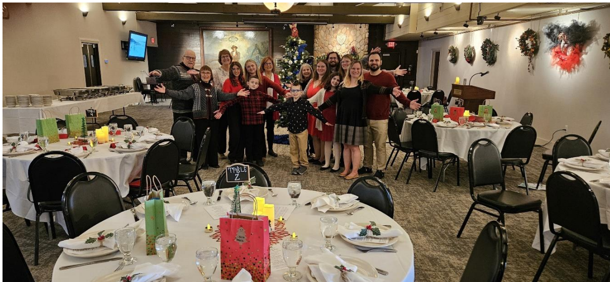
Next morning the tables are set! Note the tree in the center of the room.