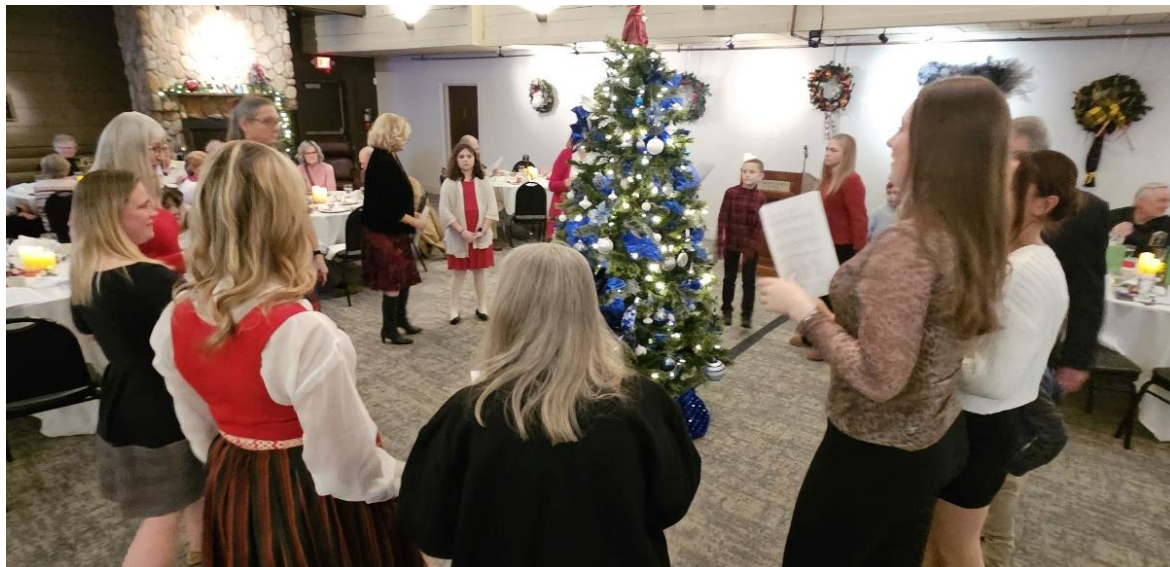
Finally, the party begins, and we celebrate with a dance around the tree!