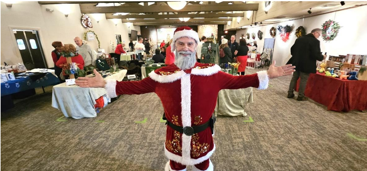
Here's how it began with Santa at the Fair. Next, our combined team got to work.

To keep costs low , no professional movers were hired. Instead, the work would be done by the Scots who organized the fair and the Norwegians who planned the party.