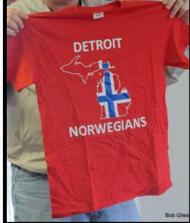
Vintage T-shirt design