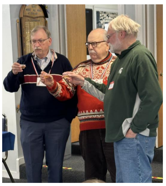
(Continued next page)