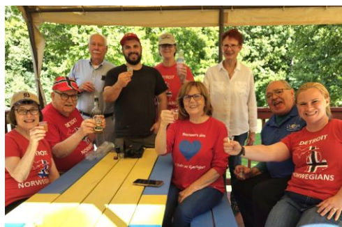
Steak & Corn Roast afterglow