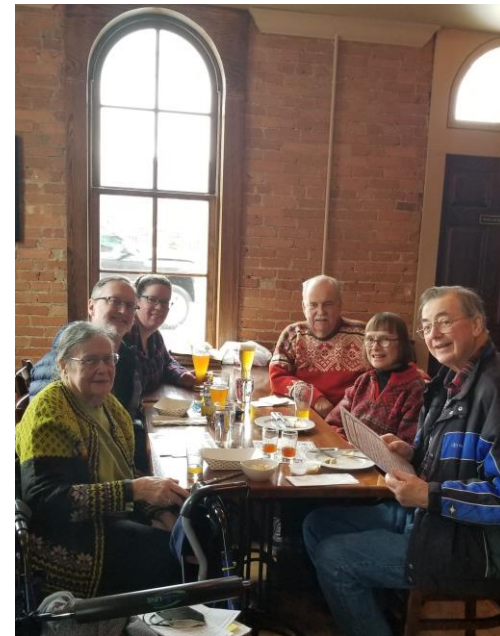
Brewpub “team” in 2023