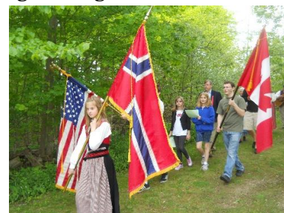
Syttende Mai parade