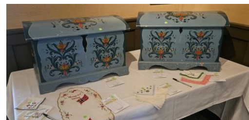
Rosemaling trunks auctioned in 2024