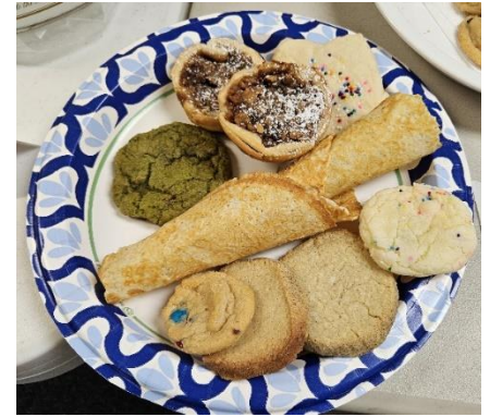
A variety of Cookies for College