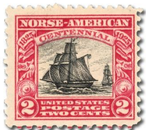
Stamp issued in 1925 for the Centennial of the Restauration's sailing

On July 4, 1825, a group of 52 Norwegians set sail on the sloop Restauration to make the first organized migration from Norway to North America. Since that voyage, about 900,000 people have followed. Today nearly five million people in North America claim Norwegian ancestry.