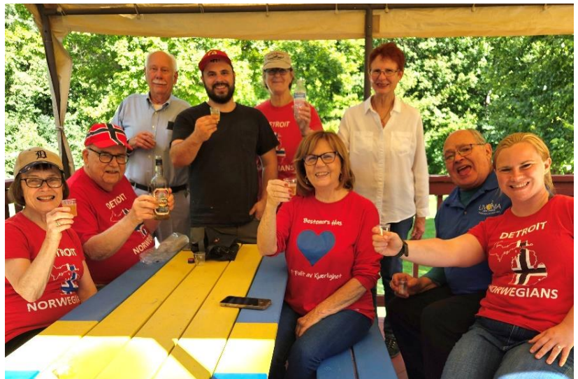
Skål! A Linie toast by the volunteers