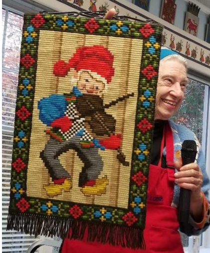
Displaying a wall hanging at Show & Tell.