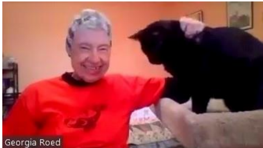
With pet cat, Fritz, at a Nordkap Zoom conference.