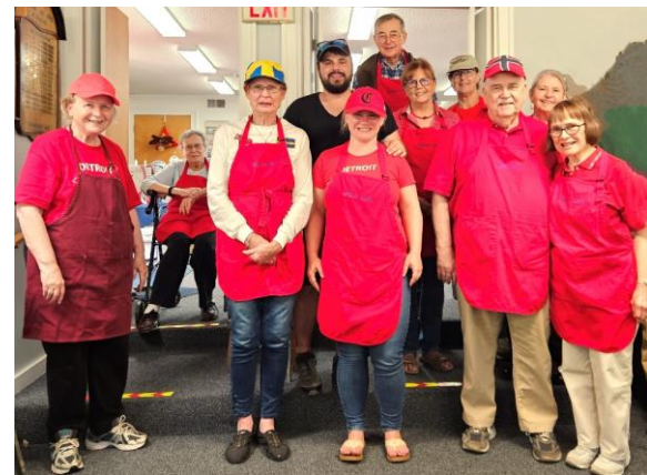
Volunteers at last year's Steak & Corn Roast

Dinner--complete with New York strip steak, roasted corn, baked beans, cole slaw, fresh tomatoes, garlic bread, dessert, and coffee--is offered for that great price of $20 for adults, $10 for children.