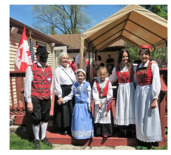
Bunad wearers at 2022 event

Admission is $5 payable at the door. Children 5 years of age and younger are free. This includes pølse (hot dogs), chips,