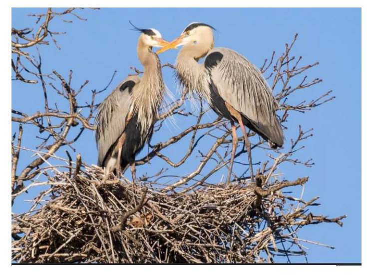
Blue Heron

There's a single-day entrance fee of $10, unless you have a 2023 Metropark pass, where it's included.