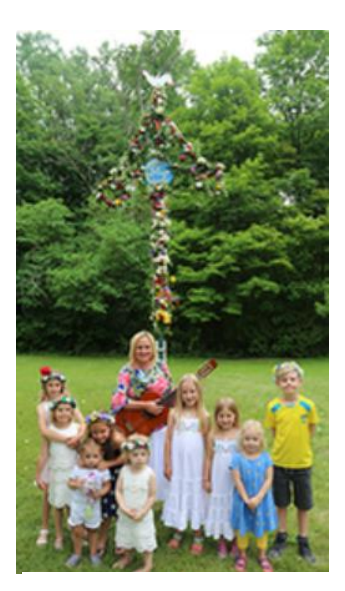
Swedish Club photo

The luncheon will be a typical Swedish Midsummer spread, normally with meatballs, potatoes, and other fixings. The price is $10, not including beer and wine. Children 15 and under are free.