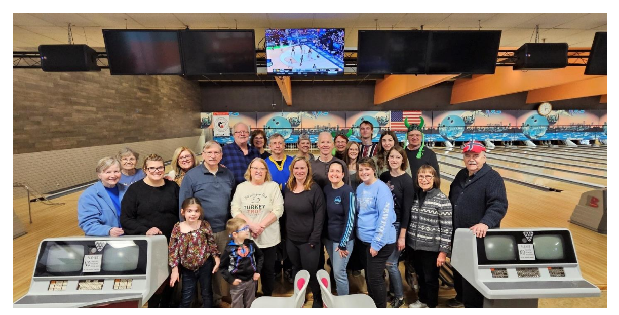
Nordkap bowlers and "Viking Cheerleaders" assembled at Country Lanes Scholarship Fund Grows with Money from Bowling Fundraiser

Our bowling fundraiser for the Nordkap Scholarship Fund was a source of great fun for families and some lodge members we haven't seen for a while. Altogether we had 17 adult bowlers, 5 child bowlers, and 12 "Viking Cheerleaders" at Country Lanes Bowling in Farmington Hills on March 19.