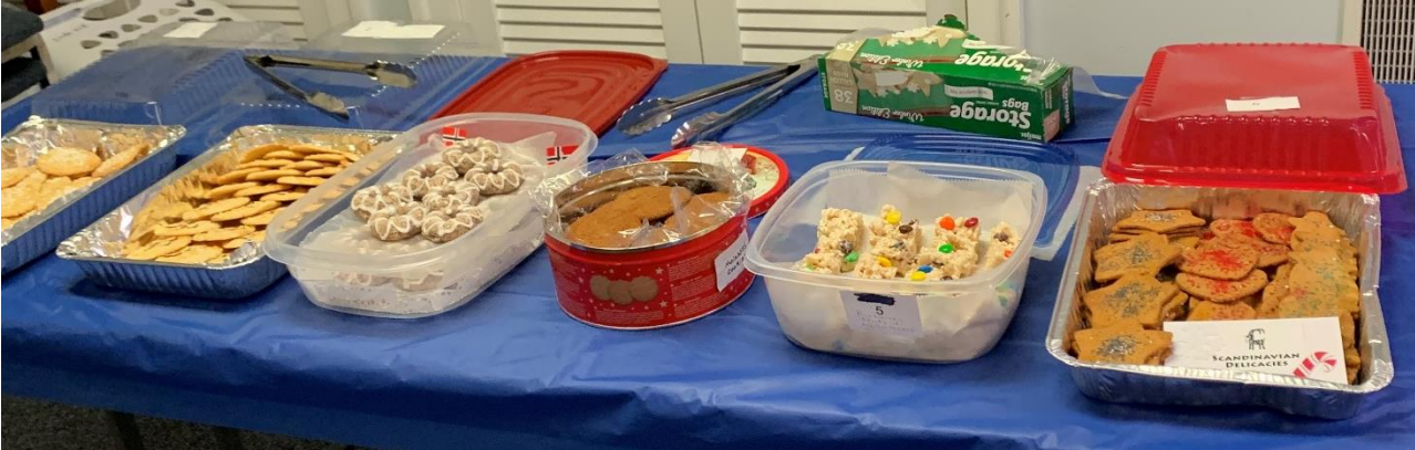
Christmas cookies donated by members.