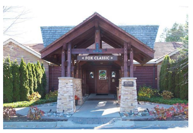
Fox Classic facility at Fox Hills

Due to pandemic precautions and closures, we were not able to hold the party in 2020. But things are now looking up, and Nordkap's Christmas Party Committee is developing plans to return to Fox Hills Golf and Banquet