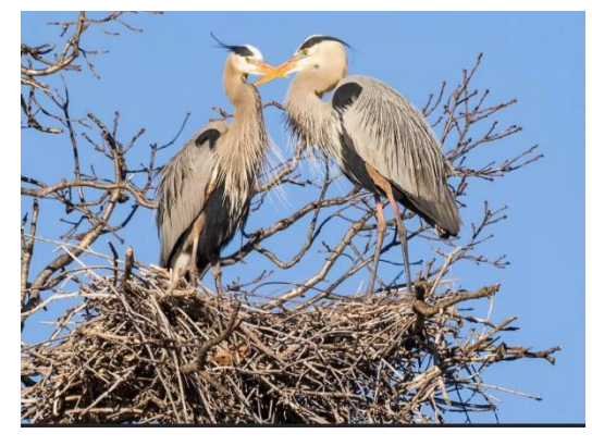
Blue Herons

If you like, also bring a snack and a chair , and after hiking we can enjoy being outside for an informal picnic.