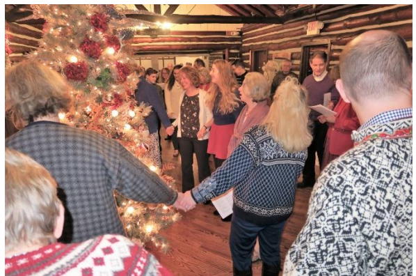
Wait until next year when festive Christmas celebrations like this one in 2019 will resume.

Please note: We have reserved NEXT YEAR’S date of December 12, 2021, at the Fox Hills Golf and Banquet Center in Plymouth, for our next Christmas party. Fox Hills is applying our previous deposit for the cancelled party in 2020 to the 2021 date. We look forward to celebrating Christmas and our Norwegian holiday traditions with you there!