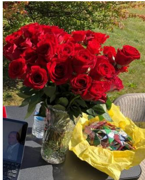
Roses and star ornaments