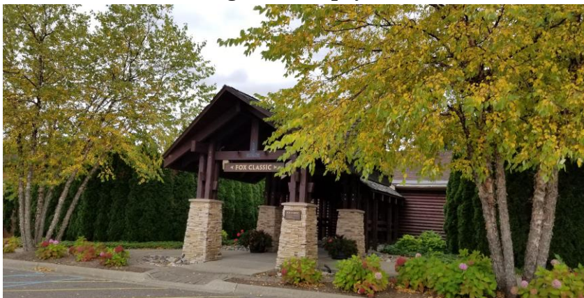
Classic Fox Clubhouse on a recent lovely fall day.