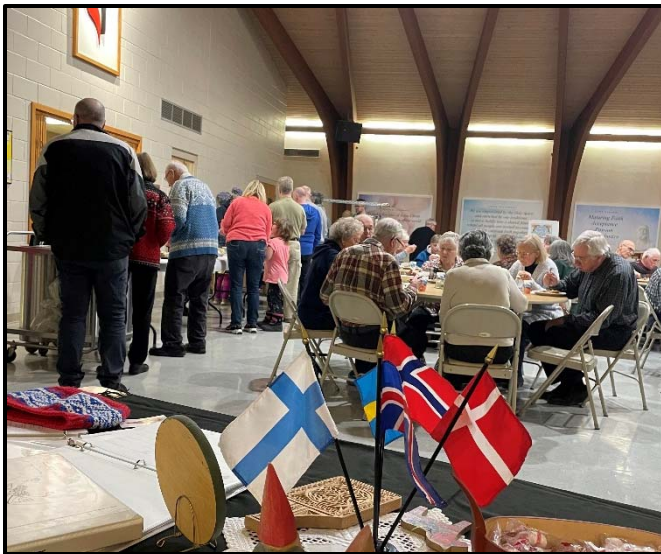
"International Night" at St Paul's UMC March 1, hosted by Vennligfolk