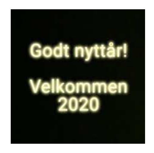
Page 13 ~ LUREN January/February 2020