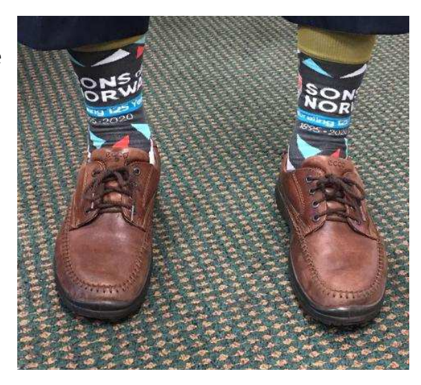
Do you know who is wearing these snazzy Sons of Norway socks? Betcha don't. Go to next page to find out.

This book was the inspiration for the Disney movie, SNOW DOGS.