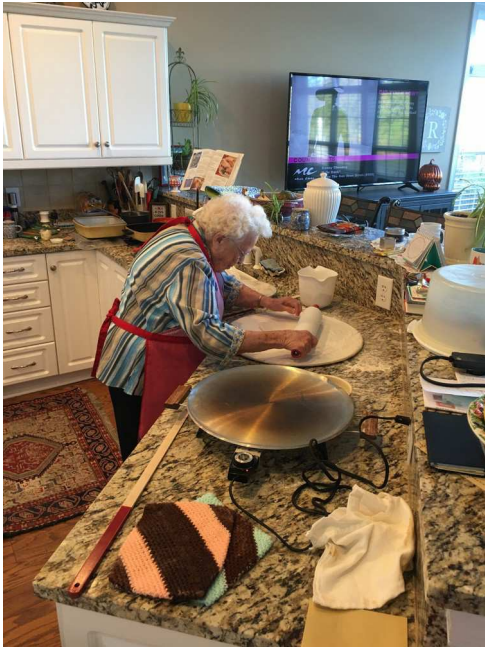
Mom rolling lefse at 93 years young.