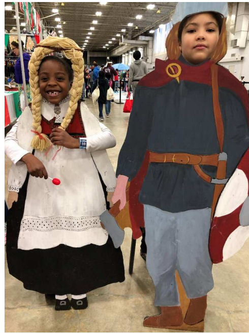
Kids having fun at Int'l Festival