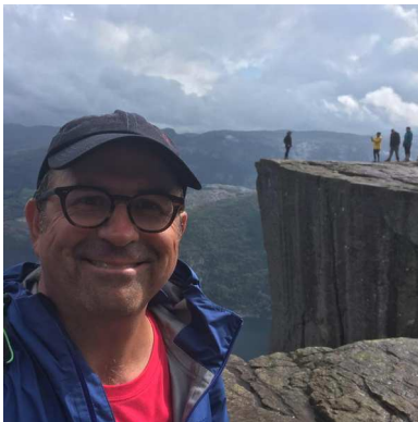
Preikestolen/Pulpit Rock/Preacher's Chair, rises 1982 feet above the Lysefjordan. It is 16 miles from Stavanger.