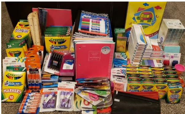
School Supply donations from our Aug/Sep collection.