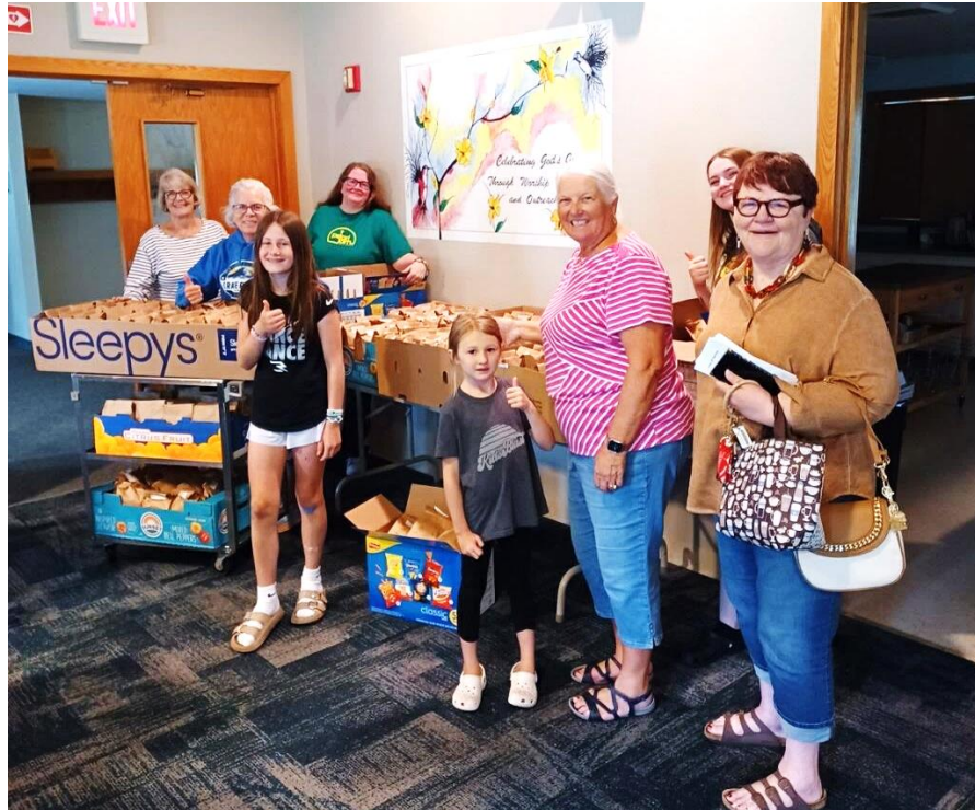
MAKING BAG LUNCHES FOR "THE GATHERING" ON JUNE 15 TH , 2024