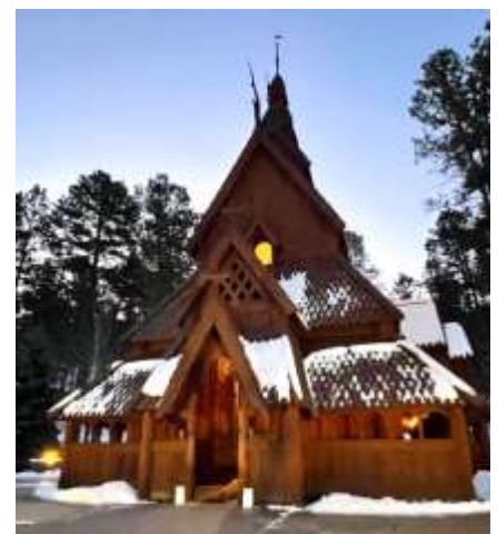
CHAPEL OF THE HILLS IN RAPID CITY, S. DAKOTA