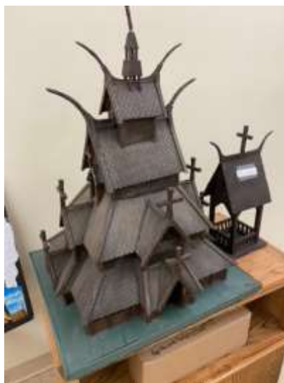
OUR LODGE MODEL