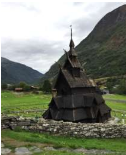
BORGUND STAVE IN LÆRDAL, NORWAY

Many of us know there is a stave church replica on Washington Island in Door County. It's near the Lutheran church there in the center of the island.