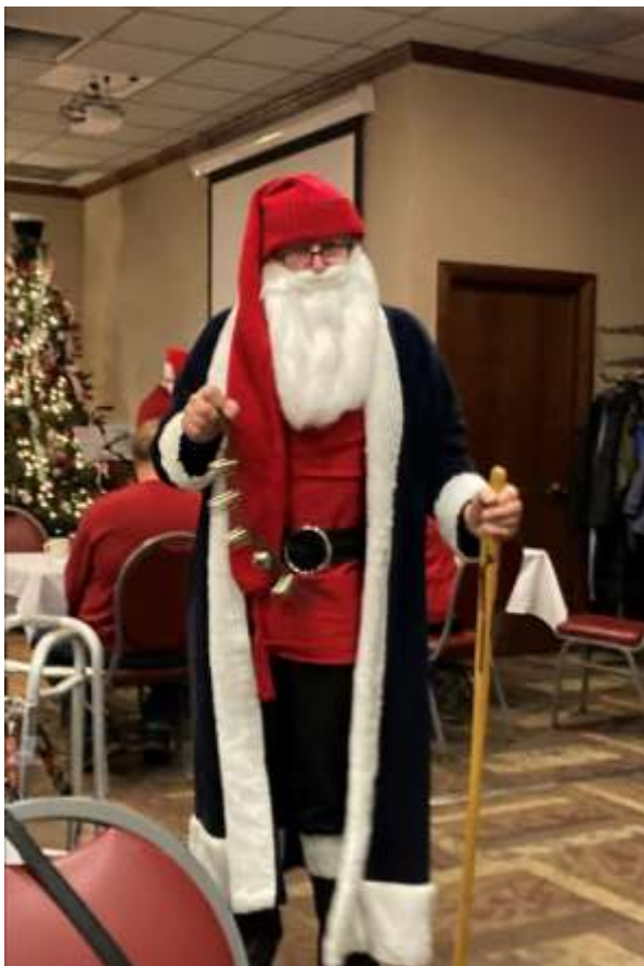
HERE COMES THE JULENISSE