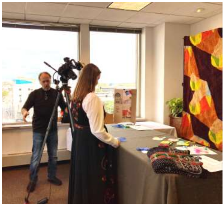
FILMING OF DEMONSTRATION