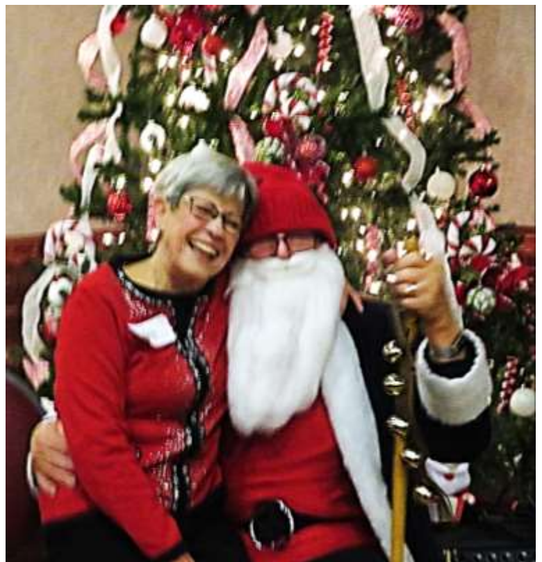
A CUTE COUPLE!