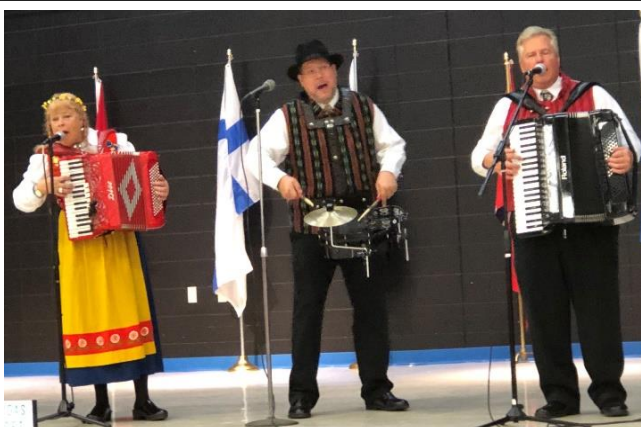
Smörgåsbandet Headline Entertainment from NYC