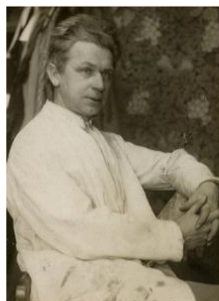
Wilhelm Rasmussen, c. 1935

The back story begins as early as 1836, when the poet Henrik Wergeland issued a call to the Norwegian people to build a memorial to mark Norway's independence. The monument was to be built outside the parliament building in Eidsvoll and was to be called "Eidsvollssøyla" – the Eidsvoll Pillar. The sculptor Rasmussen won the competition to design the monument. The pillar's decoration represents the history of Norway from the unification of the country up to the National Congress in 1814.